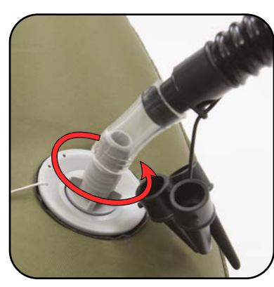
Pump, adapter, valve