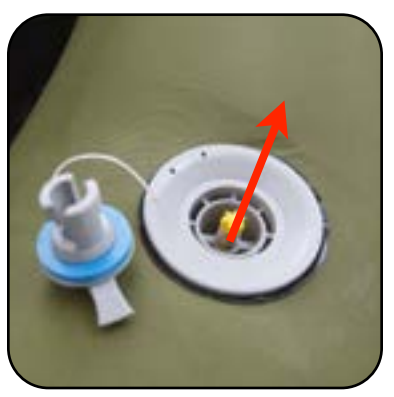
Stem up and closed